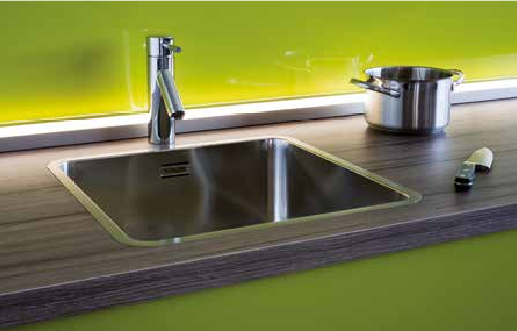
Simple, flush installation of fitted sink with RESOPLEX® Straight Ahead